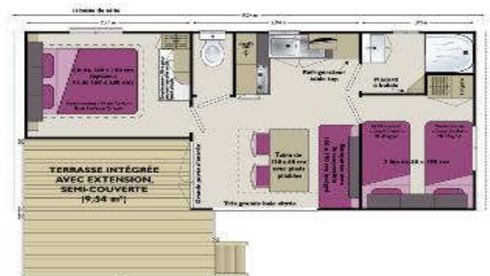
Modèle LOGGIA :